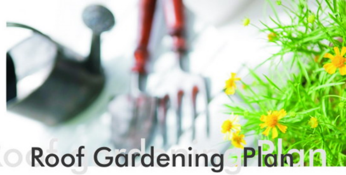
Roof Gardening Plan